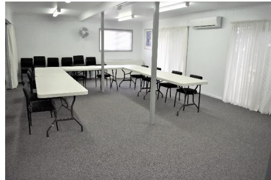
Downstairs North Room – U-Shape style, fits 12 people in this layout – tables can be added