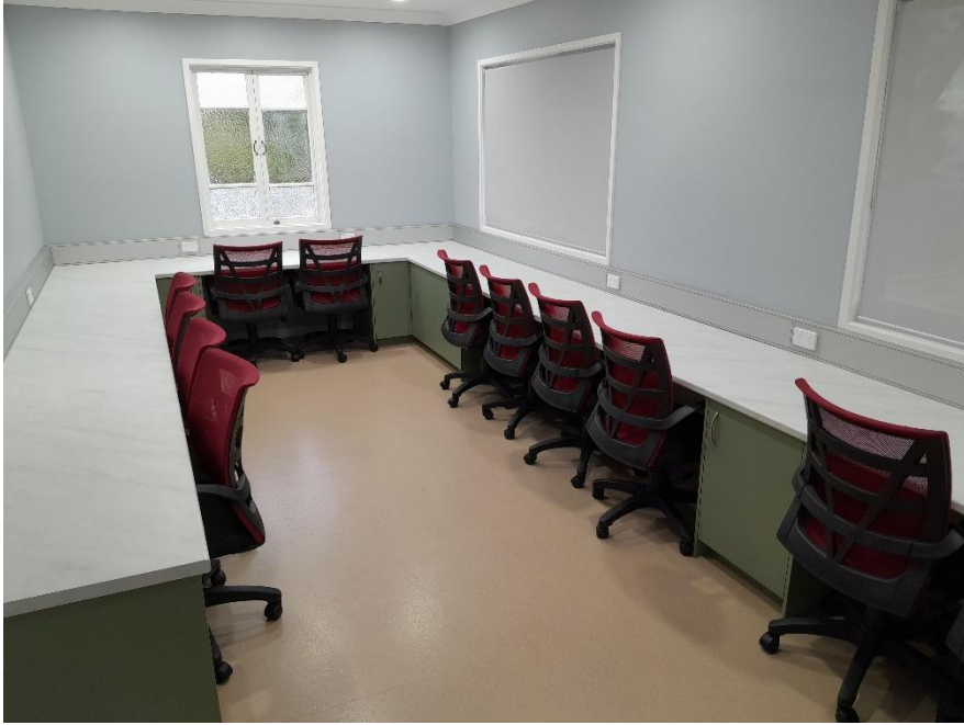
Upstairs Multi-Purpose Room – fits 12 people in this layout