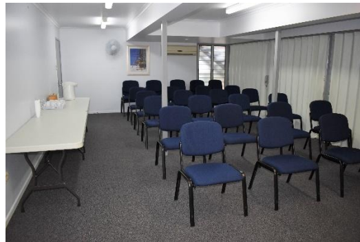
Downstairs South Room – Theatre style, fits 20 people in this layout