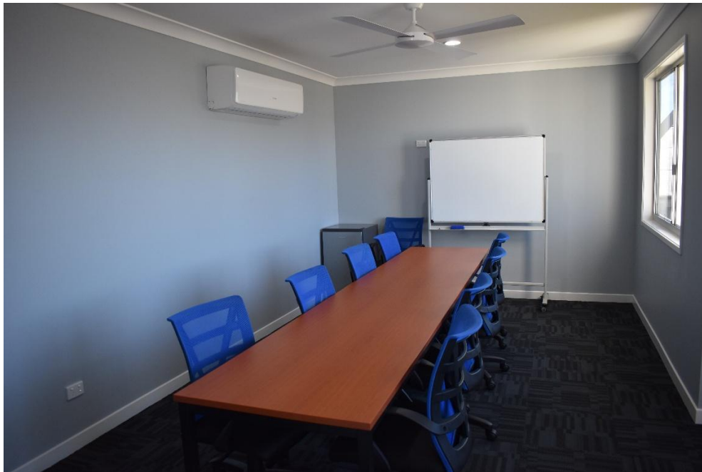
Upstairs Conference Room – meeting style, fits 14 people in this layout