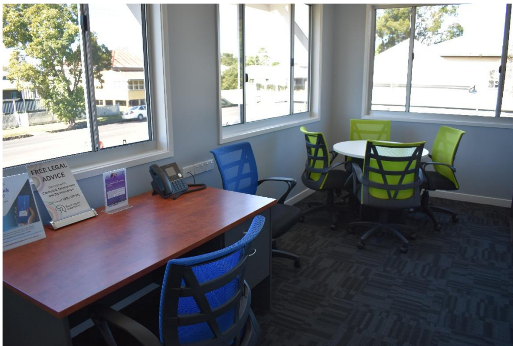
Upstairs Interview Room – fits 6 people in this layout