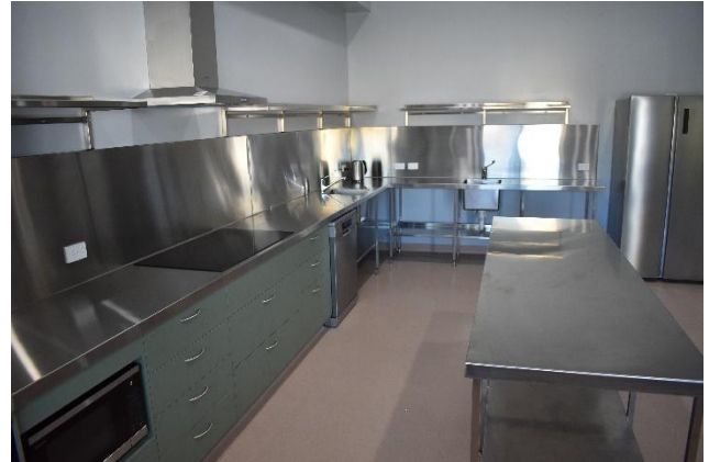
Upstairs Kitchen – fits 8 people