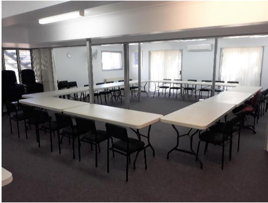
Downstairs Main Room – fits 20-30 people in this layout